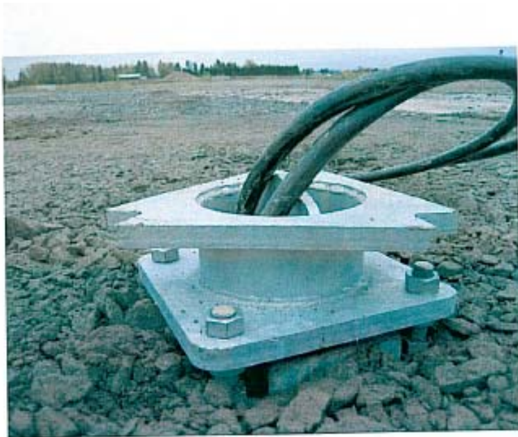
Picture 7. Lower part of the slip base from the vehicle approach path.