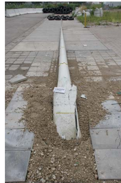
Broken Pole after impact – the car was stopped by the pole