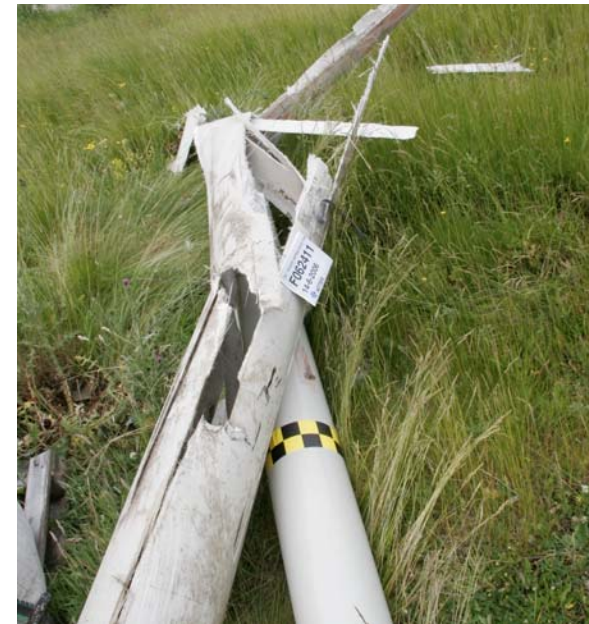
Broken Pole after impact – the speed of the car was reduced to approx. 60km/h